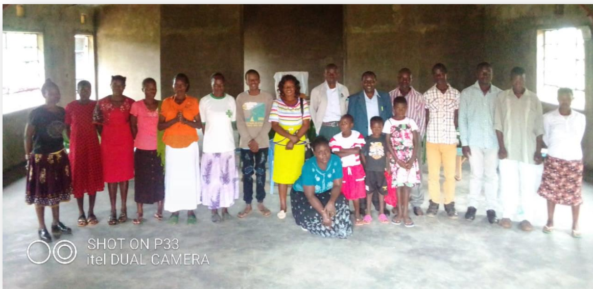
Funyula TBC attendants on Sunday 23rd June

The church at Funyula is very small, with a frequent attendance of less than 15 people during Sunday worship Service, mostly comprised of women. There are only 3 men who consistently attend church.