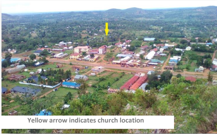
Yellow arrow indicates church location

casual workers we had on site too were new in the town.