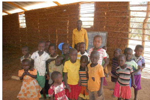
ECD = Early Childhood Development