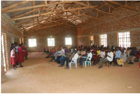
Kasei Trinity Baptist Church