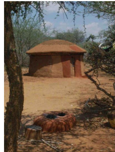
A traditional hut and fireplace. The roof is made of mud as raiders would set fire to thatch.