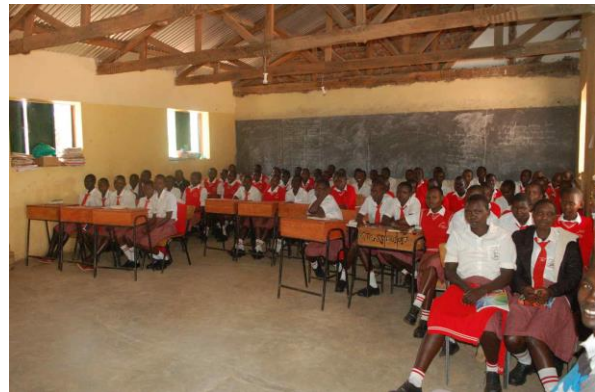
Kamketo Trinity Girls Secondary School students on Monday listening to a testimony and exposition about conversion.