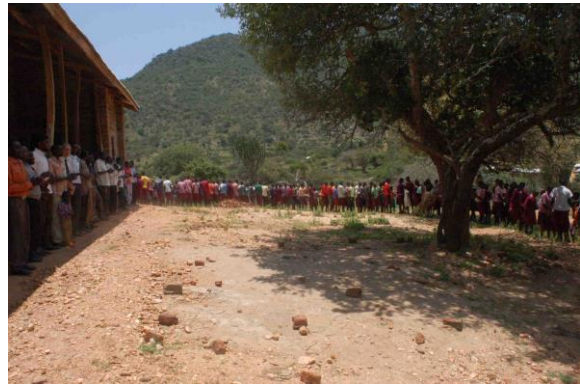
Greetings circle after the service