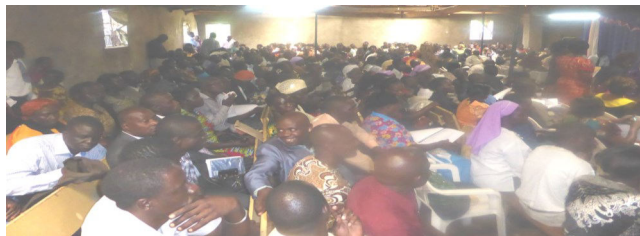
RIGHT: DELEGATES WHO ATTENDED THIS YEAR'S REFORMATION CONFERENCE 2016 AT MUMIAS KENYA